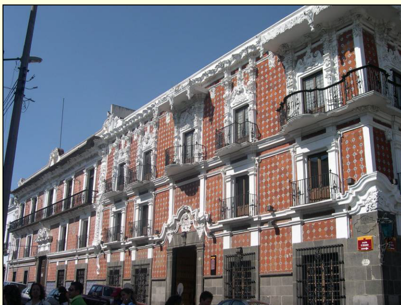
The House of the Alfeñique.

Details for payment are given in the web site, where the Registration and Payment Form must be downloaded. After filling the form, it must be faxed both to the Organizing Committee and the Sociedad Mexicana de Fisica offices.