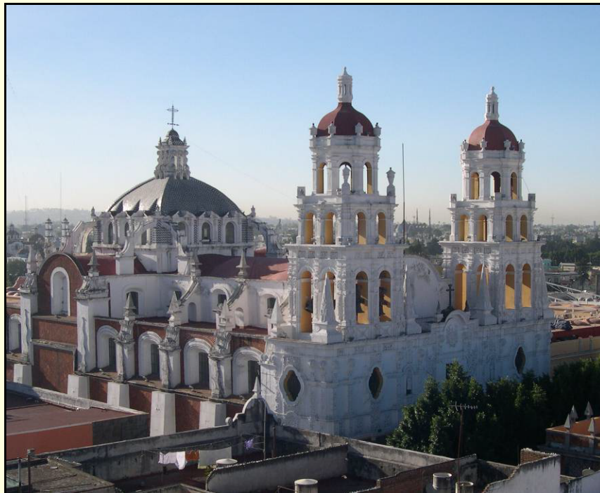
La Compañía church, adjacent to the Edificio Carolino.

The Conference will be held at the Edificio Carolino , a colonial building in custody of the Benemérita Universidad Autónoma de Puebla . The oral presentations and poster sessions will take place in this building. Also, a commercial exhibition and internet rooms will be located in the same area.