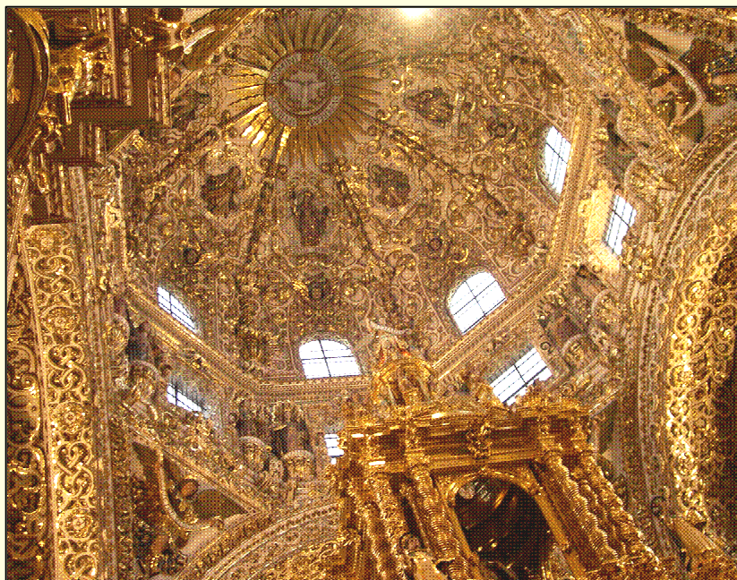
Capilla del Rosario

It is now over thirty years since the first international PIXE conference was held at the University of Lund, Sweden. Now we are looking forward to meeting for the eleventh conference at Puebla in Mexico. During these three decades, PIXE has matured from being an esoteric spin out of Nuclear Physics to a mainstream analytical technique which is making important contributions in fields as diverse as climate change, salmon fishery policy and cultural heritage. At the Puebla conference we can look forward to discussing the usual exciting mix of new developments in PIXE theory and techniques together with advances in traditional and novel areas of application. On behalf of the International Advisory Committee I would like to extend a warm invitation to all scientists to join us for the 11th conference in the hospitable and vibrant atmosphere of this historic city.