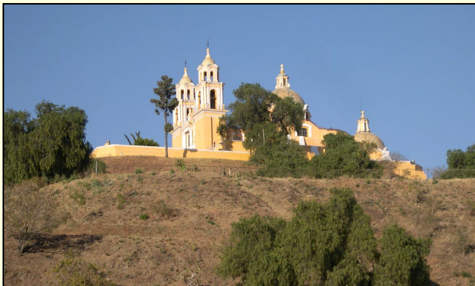
Colonial church built at the top of the Cholula prehispanic pyramid.