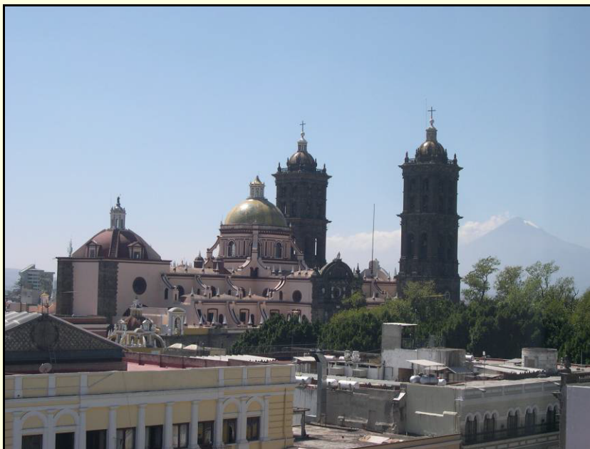
The Puebla Cathedral, with the Popocatepetl volcano in the back.